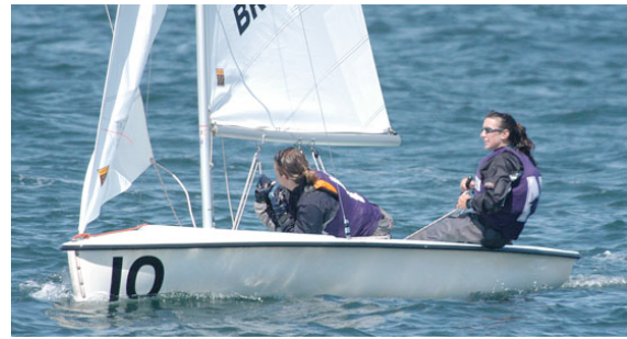
Northwestern B Team