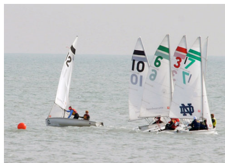
Minnesota leads after the offset mark